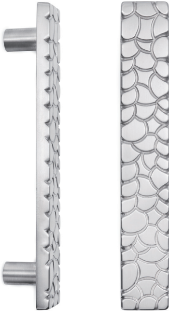
PULL HANDLE 7002