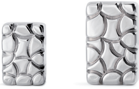
THUMB TURN 7002 (S/L)