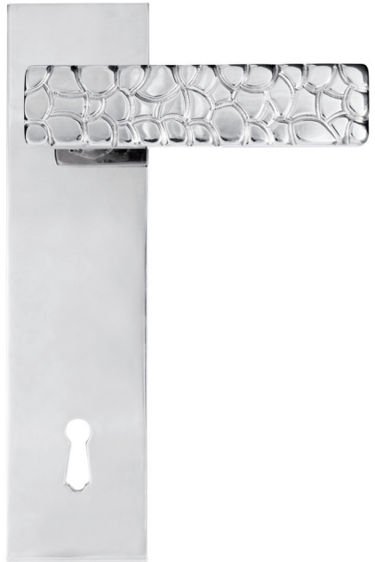
LEVER HANDLE 7002 ON PLATE 1000