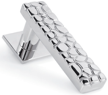
LEVER HANDLE 7002 ON ROSE 1000