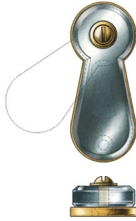
Key Escutcheon with Crystal Cover