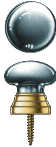
Crystal Shutter Knob Shown without Rose