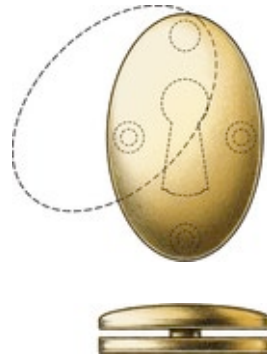
Emergency Trim Ring with Swinging Cover