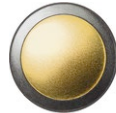
Cylindrical Floor Stop with Trim Ring