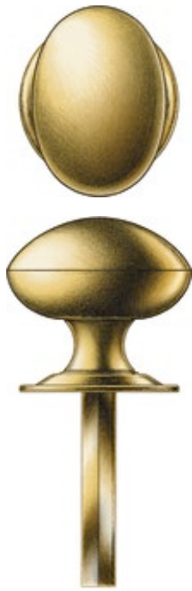
Thumb Turn & Rose