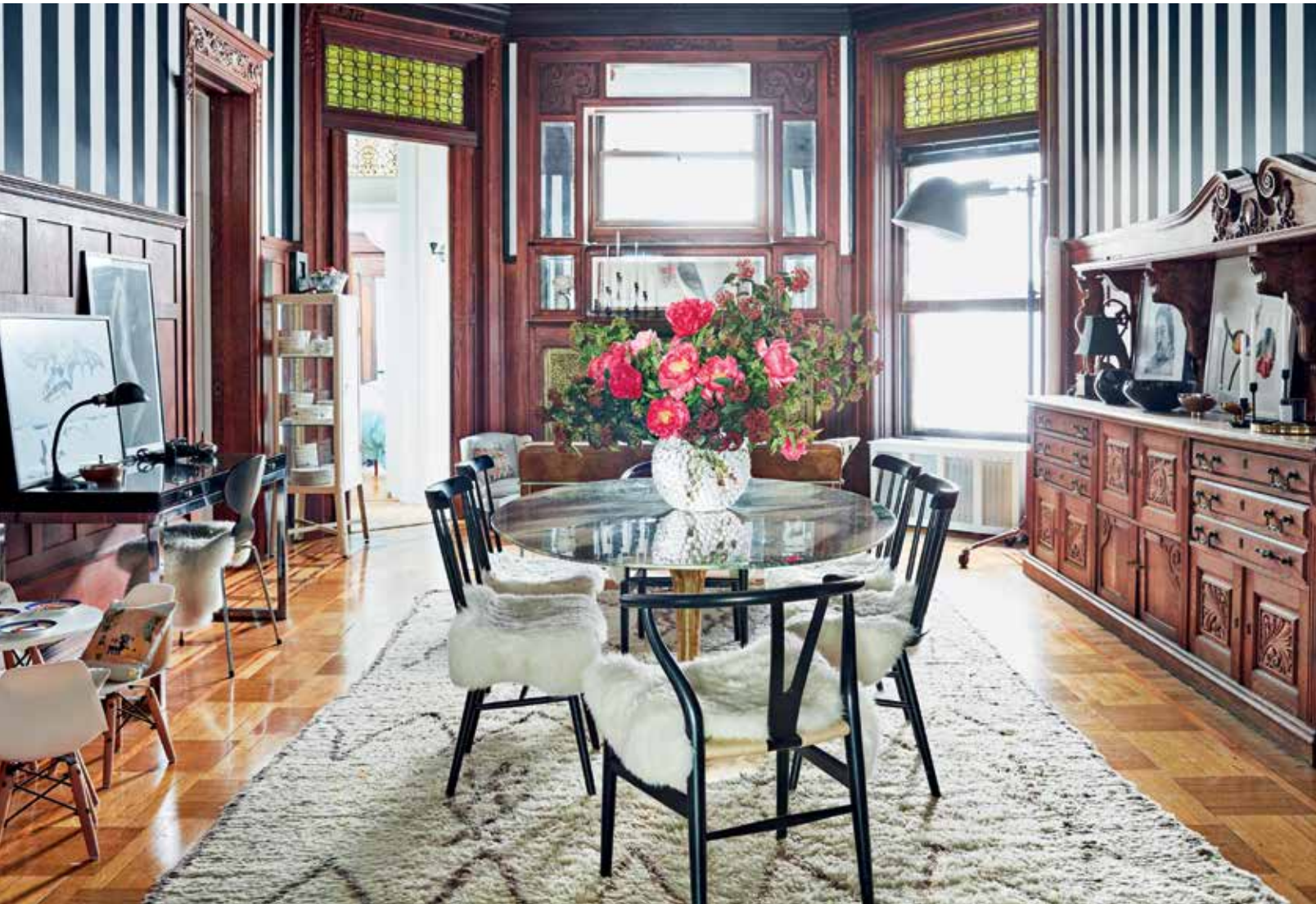
Dark wood and striped wallpaper set the backdrop for softer Scandi touches in the dining room (above), while the children's nook (right) is filled with travel finds, such as a dream catcher brought back from Tulum, Mexico. Opposite: In the office, iconic Richard Avedon portraits hang next to vintage pieces, like a framed knit American flag.